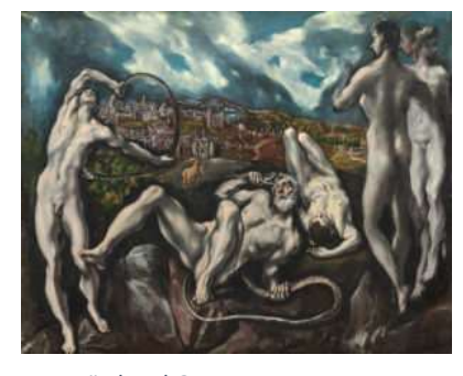
Laocoön by El Greco

Mannerist figura serpentinata . While Bronzino's portraits are often incredibly calm and stoic, that cannot be said for Venus, Cupid, Folly, and Time . The lack of background and the figures' layout makes everything seem chaotic and claustrophobic. Everything is all over the place, with bright colors contrasting, throwing the earlier Renaissance ideals like balance and harmony out the window. Scholars have long debated the meaning of the painting, with some saying it's about forbidden passion while others claim it's about syphilis.