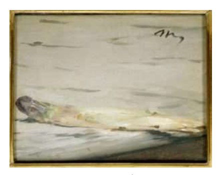
A Sprig of Asparagus by Édouard Manet

Édouard Manet is considered one of the greatest European artists of the nineteenth century for having carved out his own variety of modernism between the Paris Salon and the nascent Impressionist movement. Because of the importance of his work, we often look at it through a rather strict academic lens. However, in some of his paintings, we see touches of lighthearted humanity. This is most apparent in a pair of paintings commissioned by the critic and collector Charles Ephrussi. In 1880, Ephrussi promised Manet 800 francs for a still-life of asparagus. Manet delivered on his commission, giving us Une botte d'asperge , a good-sized look at a bundle of white asparagus with purple tips laying upon a bed of greenery, much like a Paris grocer might display his inventory at the time. Research on the canvas has since revealed that Manet created the work painting wet on wet, meaning that he likely created the whole painting in a single sitting. Ephrussi enjoyed