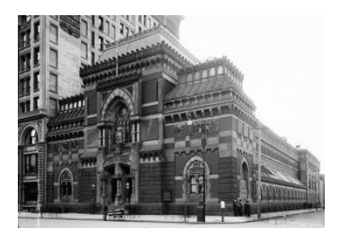
The Pennsylvania Academy of the Fine Arts

The Pennsylvania Academy of the Fine Arts (PAFA) in Philadelphia is the oldest art school in the United States. It has trained generations of artists forever over two centuries. And now, after all that time, it will end its degree-granting programs in 2025.