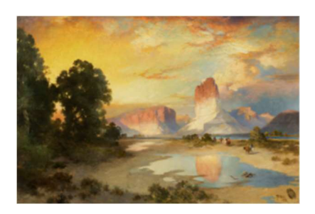
Afterglow, Green River, Wyoming by Thomas Moran

throughout the 1870s and 1880s. Predicted to sell for between $1.2 million and $1.8 million, the Heade surpassed expectations, with the hammer coming down at $2.8 million (or $3.4 million w/p).