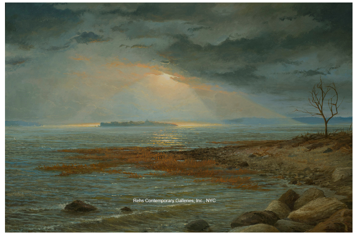
Ken Salaz Forgiveness 1