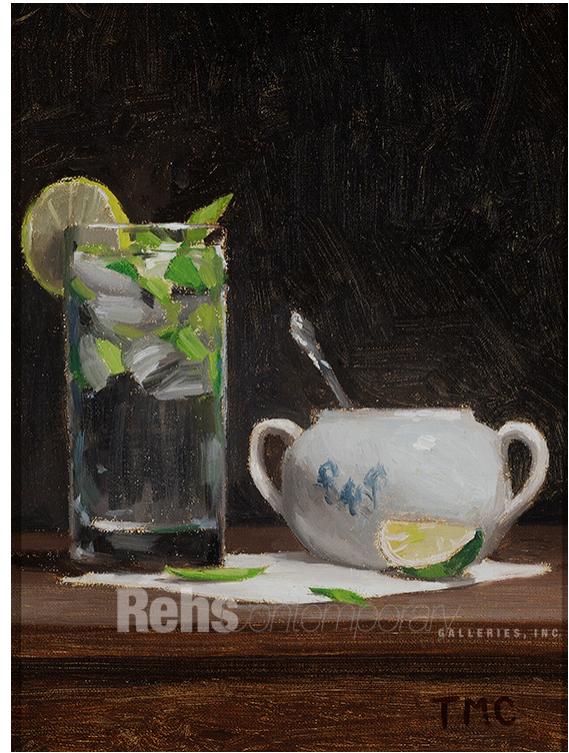
Todd Casey Mojito