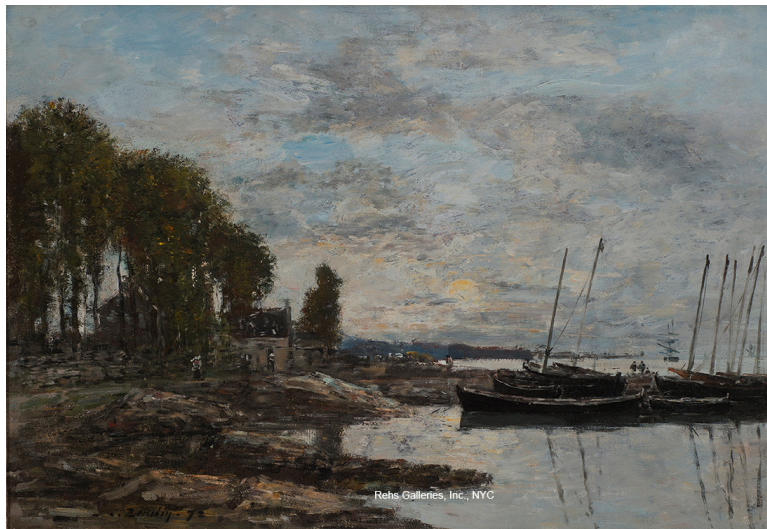
Eugene Boudin Le Rivage a Plougastel