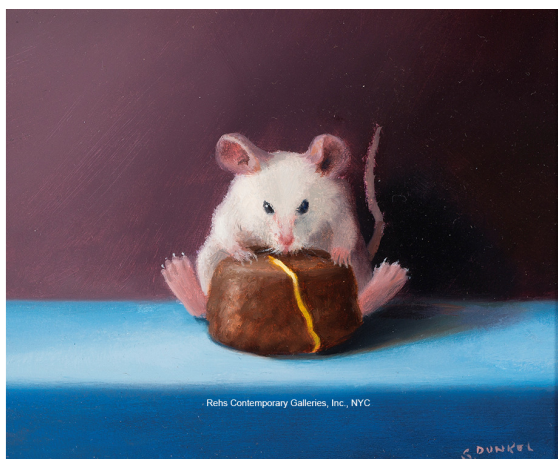
Stuart Dunkel Sit Down Too