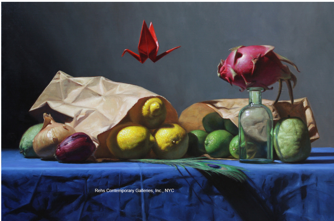
Noah Layne Flight of Hope