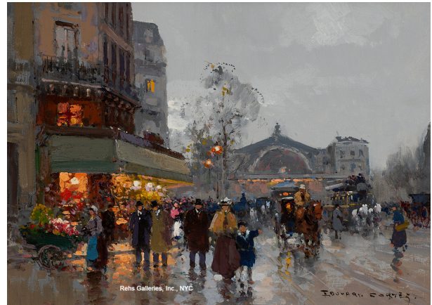
Edouard L. Cortes Gare de l'Est