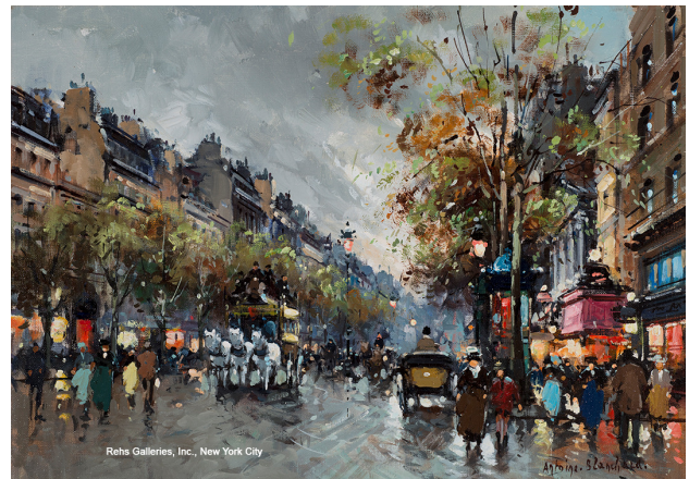
Antoine Blanchard Theatre des Varietes